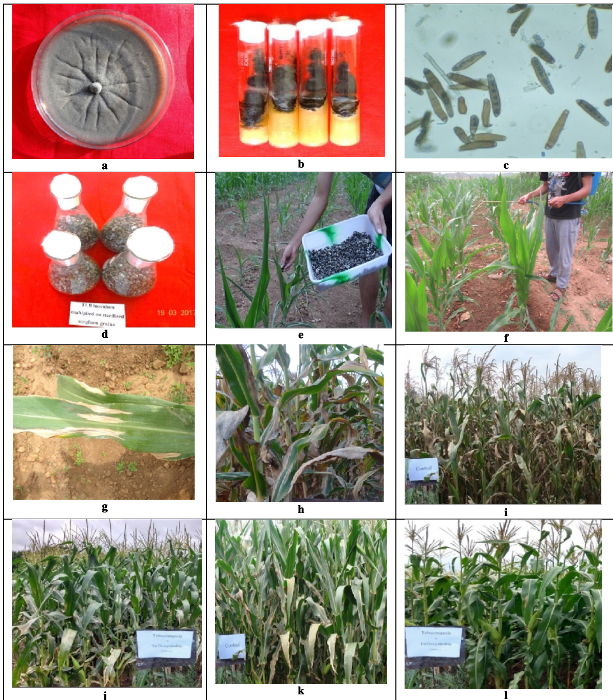
Plate1: a) Pure culture on PDA, b) PDA slants, c) E. turcicum conidia, d) Mass multiplication on sorghum grains, e) Leaf whorl technique, f) Spraying method, g) Disease symptoms at 35 DAS, h) Disease symptoms at 80 DAS, i) and k) Control, j and l) Chemical spray with trifloxystrobin 25% + tebuconazole 50% in Kharif and Rabi 2016.